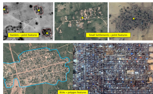
Image 1: High-Resolution Imagery Helped Create More Accurate Population Estimates in Northern Nigeria

No single approach to measurement would have been capable of meeting decision support needs. Field surveys were too slow and prone to error. High-resolution imagery could detect structures but not generate estimates of populations. By combining these two sources of information, along with other data such as road networks and land cover maps, it was possible to generate highly accurate estimates of population distribution in less than three months. These new estimates were instrumental in the effort to deliver vaccines where and when they were needed.